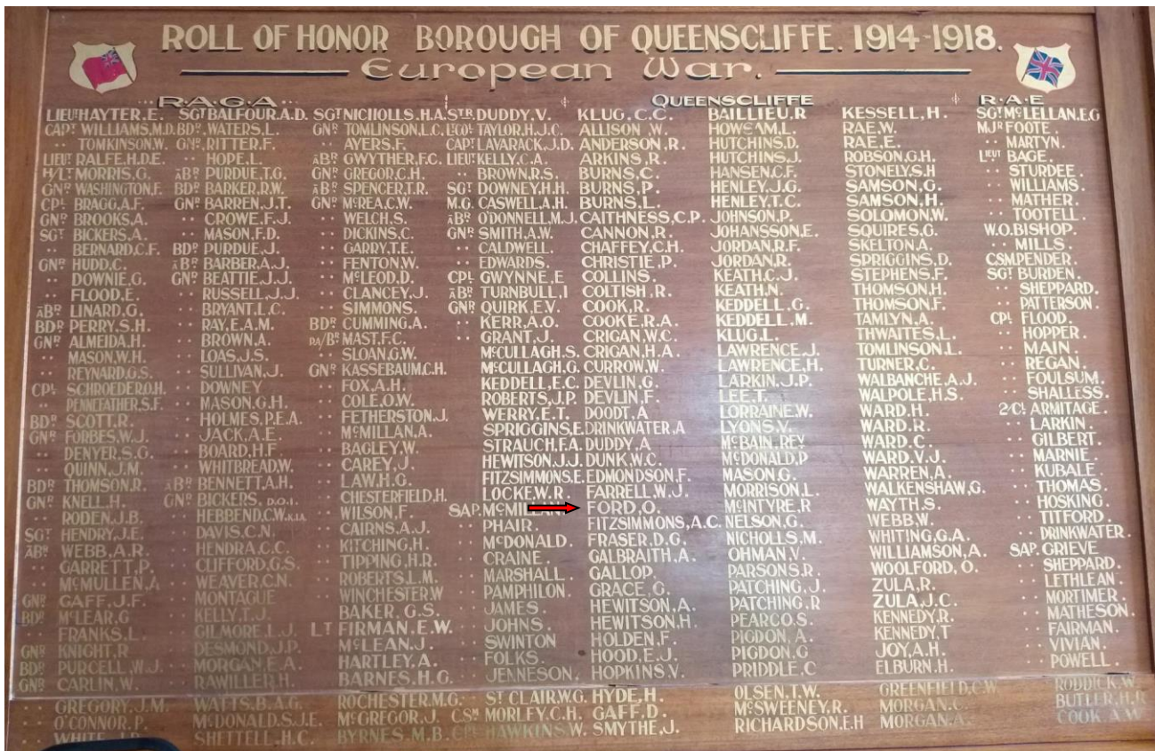
Borough of Queenscliffe Roll of Honour