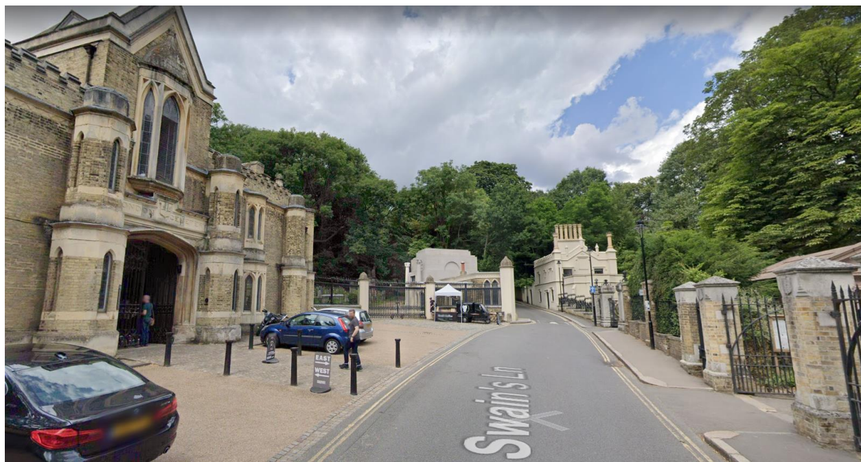
Highgate Cemetery with sign showing East (to right) & West (to left) (Streetview)