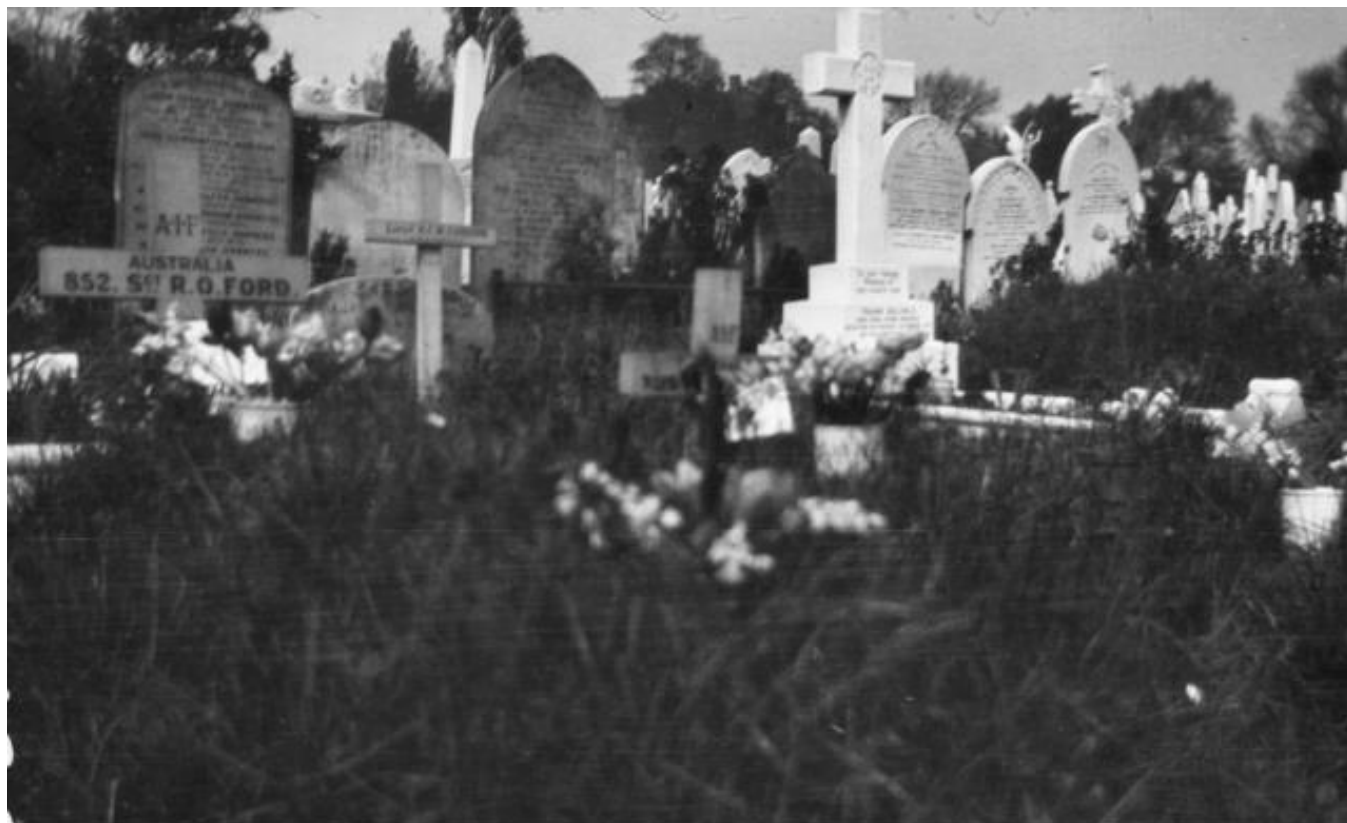
AUSTRALIAN WAR MEMORIAL