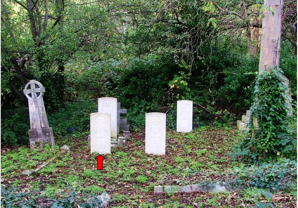
Sergeant Ford's Headstone (front left)